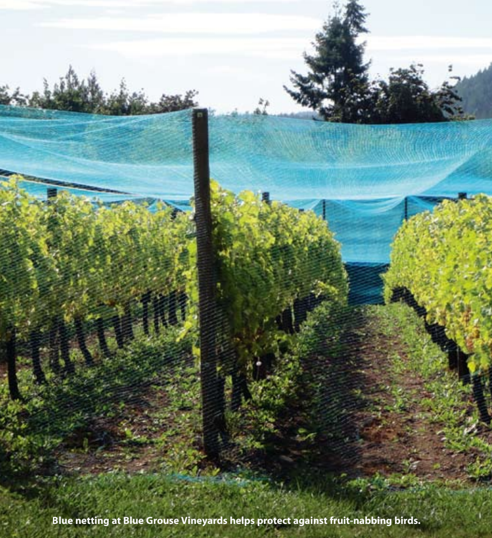
Blue netting at Blue Grouse Vineyards helps protect against fruit-nabbing birds.