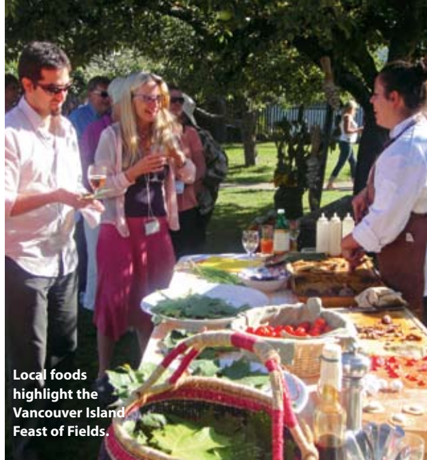
Local foods highlight the Vancouver Island Feast of Fields.

If anything epitomizes the local food sentiment, it is this twelve-year-old benefit for the nonprofit FarmFolk CityFolk, which funds local greenhouses, gleanings, and other